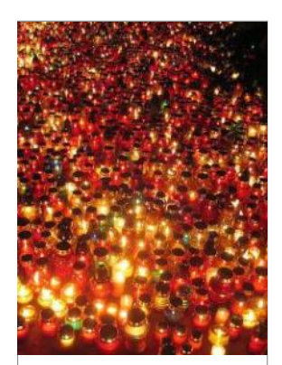
The dark is bright with quiet lives and steady lights undimmed